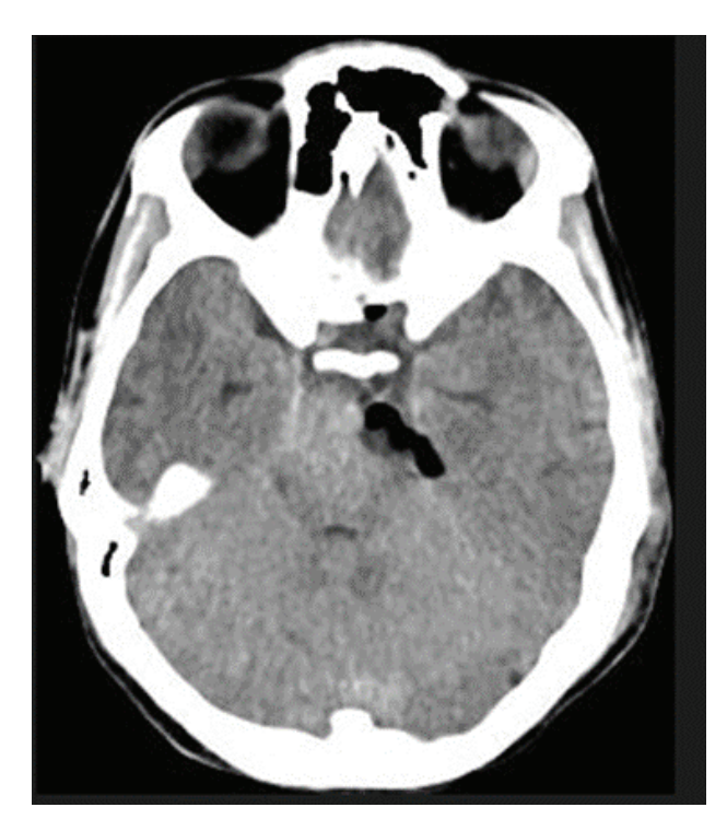
Figure 4: Post operative CT scan of head revealed gross total removal of tumor.