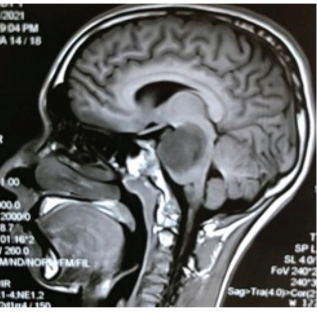
Figure 1: Magnetic resonance imaging (T1 axial and saggital) shows diffuse altered signal intensity area involving the pons with its asymetrical expansion predominantly on the left aspect measuring 29 \times 32 \times 39 mm. The lesion is causing dorsal displacement of floor of the fourth ventricle with compression of the middle cerebeller peduncle more on the left side, and is abutting the basilar artery and its anterior displacement with normal flow voids.