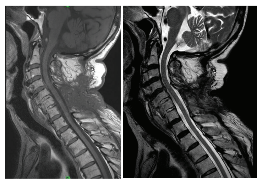
Figure 2: Post operative MRI (a and b)showing complete decompression of the cord