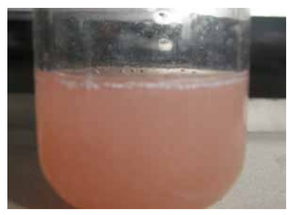
Figure 2. Mature shake test showing ring of bubbles at the meniscus

The shake test was performed as described by Clements et al<sup>8</sup> in 1972. 1ml of collected amniotic fluid was taken in the standard test tube (12x100mm). 1ml of 95% ethanol (5ml deionized water plus 95ml absolute ethanol) was added into the test tube containing 1ml of undiluted amniotic fluid. The tube was shaken vigorously for 15 seconds and placed in upright rack for 15 minutes. Observation for a complete ring of bubbles at the meniscus after 15 minutes was done. The test was considered positive or the fetal lung is mature if it showed a complete ring of bubbles at the meniscus after 15 minutes (Fig.2). The test was considered negative or the fetal lung is immature if incomplete or no ring of bubbles at the meniscus was observed after 15 minutes.