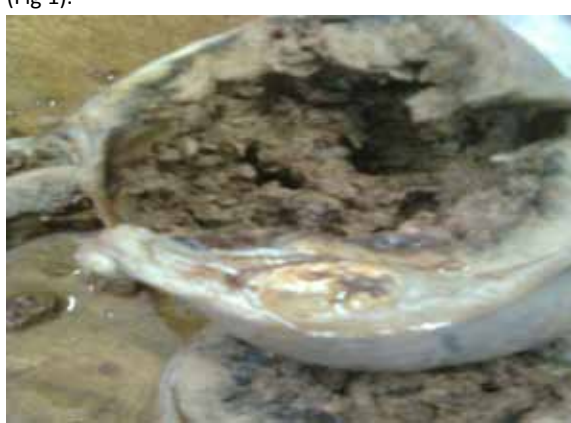
Figure 1. Cut Section of Uterus showing degeneration changes in middle of fibroid

A lady of 45 yrs age came with complaints of pain abdomen, swelling of abdomen and heavy vaginal bleeding. Her menstrual pattern was normal; only the amount was slightly heavy. She had a spontaneous vaginal delivery 25 yrs back. Ultrasonogram reported a large solitary fibroid uterus with degenerative changes in the middle portion. Total abdominal hysterectomy was done along with bilateral salpingo-oophorectomy within a week. In gross specimen there was subserosal variegated growth 10 cm in diameter, showing extensive hemorrhage and necrosis (Fig 1).