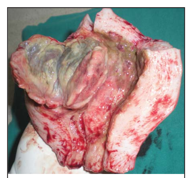
Figure 4. Showing placenta increta in posthysterectomy of the same case described in figure 3.

To summarize, there were four cases of morbid adhesion of placenta, two cases of placenta accreta, one in a central placenta previa with accreta, placenta increta and placenta percreta, latter, which perforated the uterus with resultant hemoperitoeum described just above. Including this case of placenta percreta, total seven cases of uterine rupture were responsible for the peripartum hysterectomy. There were two cases of twin, both of them had first vaginal delivery by vertex at home and hospital and second twin CS for transverse lie.