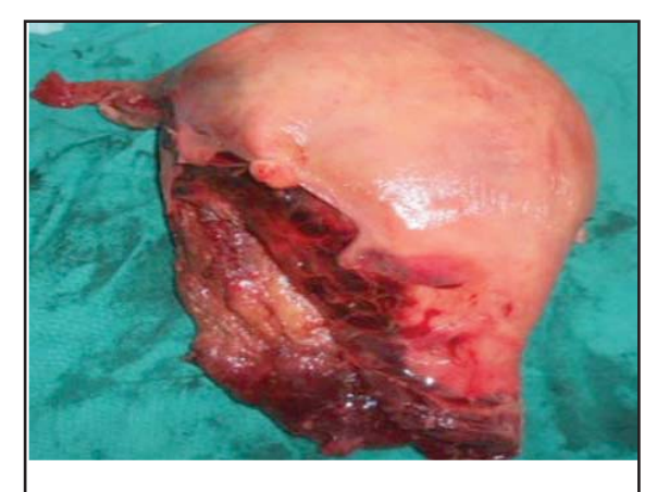
Figure 1. Rupture of unscarred uterus at induction of labour with misoprostol.

Two cases had induction of labour one with tab misoprostol 25 mcg 2 doses 4-6 hours apart and another with intracervical dinoprostone gel (cerviprime) 0.5 mg, two doses six hours apart. Induction in the first case was done for severe preeclampsia, who experienced excruciating pain and subsequently collapsed after vomiting on laparotomy, 3.5 L of hemoperitoneum and uterine rupture was observed (Figure 1).