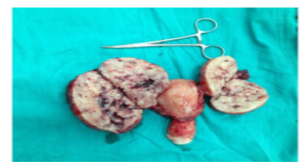
Figure 3. Cut section of bilateral ovarian tumor.

The excised tissue sent for histopathological examination was consistent with bilateral ovarian non-Hodgkin's lymphoma with extragonadal involvement (peritoneal biopsy and omentum were positive for tumor). Immunohistochemistry of the same showed Leucocyte common antigen (LCA), CD20 and Bcl-6 being positive favoring diffuse B-cell non-Hodgkin's lymphoma.