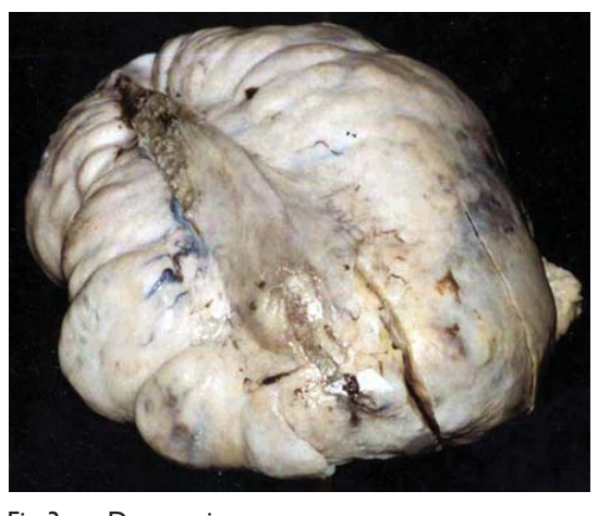
Fig 3. Dysgerminoma