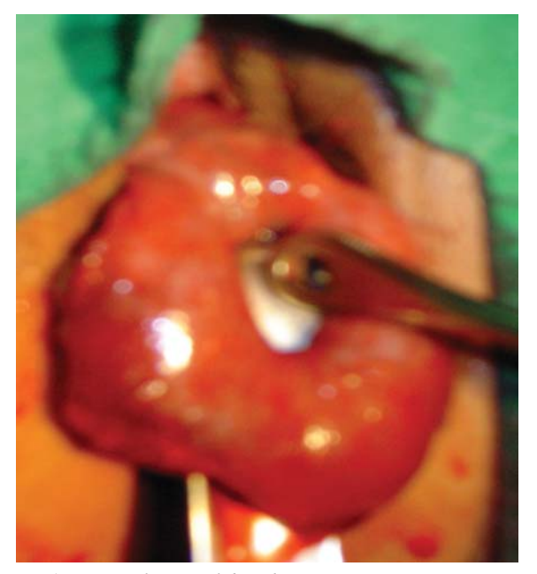
Fig1a: annural cervical detachment

Instrumental delivery was met in very small number that is 5 cases. Even the baby's average birth weight was 3.21kg (range 19 00- 4500) and 5 cases had baby's weight equal to or more than 4000gms inclusive of this baby's birth weight more than 3500gms were recorded in total 29 case.