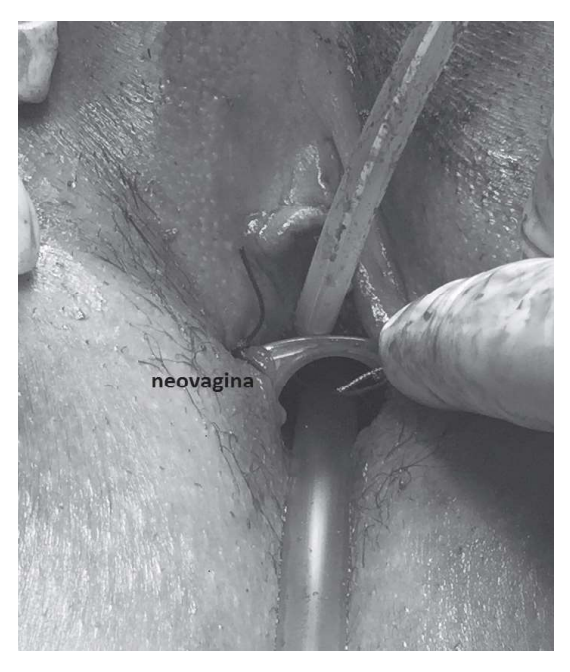
Figure 2: Showing mould passed through neovagina.

Cystoscopy performed revealed an orifice of size about 0.5 cm in posterior wall of mid urethra. Laparotomy was performed for pull through surgery for vaginoplasty from above. Intraoperative findings included normal sized ovaries, fallopian tubes and uterus. Repair of the urethrovaginal fistula with a urethroplasty was done. With a transverse incision at the level of the hymenal ring, dissection was carried out through the fibrous tissue until the upper vagina was reached, and around 50 ml of dark chocolate colored fluid was drained from uterus. The vaginal mucosa was then identified and brought down to the introitus, where it was sutured to the hymenal ring. A 5 cm vaginal mould was placed in neovagina (Figure 2), which was removed after 48 hours. The patient had received both preoperative and postoperative counseling regarding manual vaginal dilatation, future sexuality and fertility. On first follow-up, patient was taught to use vaginal dilator and advised for further follow-up. The patient is doing well as per her last follow-up at 6 months. She has started menstruating per neovagina.