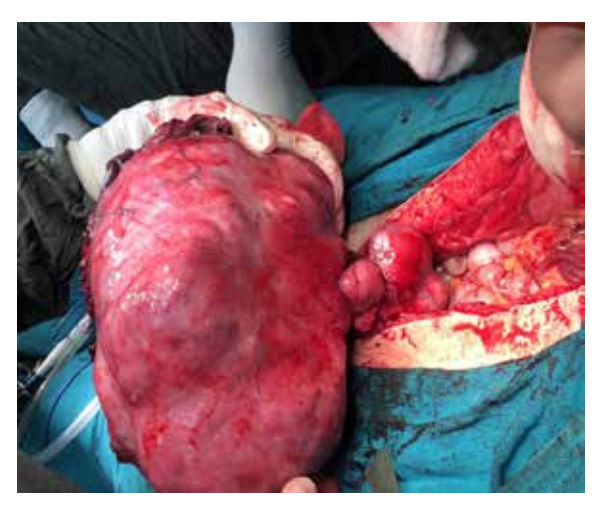
Figure-3: Subserosal myoma arising from the fundus of uterus with small avascular pedicle with three buddings of 3x3 cm in posterior surface of mass.

Omentum was adhered to the anterior surface of the mass and blood vessels were derived from omentum suggesting its blood supply from it. Mass was arising from the fundus of bulky uterus with small avascular pedicle thus was subserosal in nature. Three buddings of 3x3 cm noted in posterior surface of mass [Fig-3].