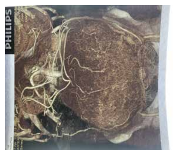
Figure-1: CT angiography showing mass with anonymous branches of superior mesenteric artery with multiple collateral vessels and multiple feeders supplying the mass.

feeders supplying the mass likely from the inferior pancreaticoduodenal and right colic artery [Fig-1].