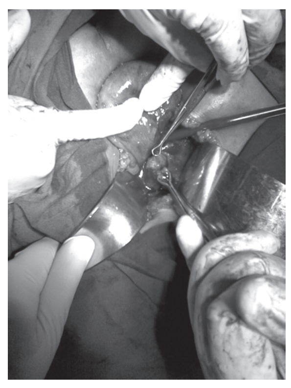
Figure 3. Surgical dissection shows urinary bladder and uterine opening separately.