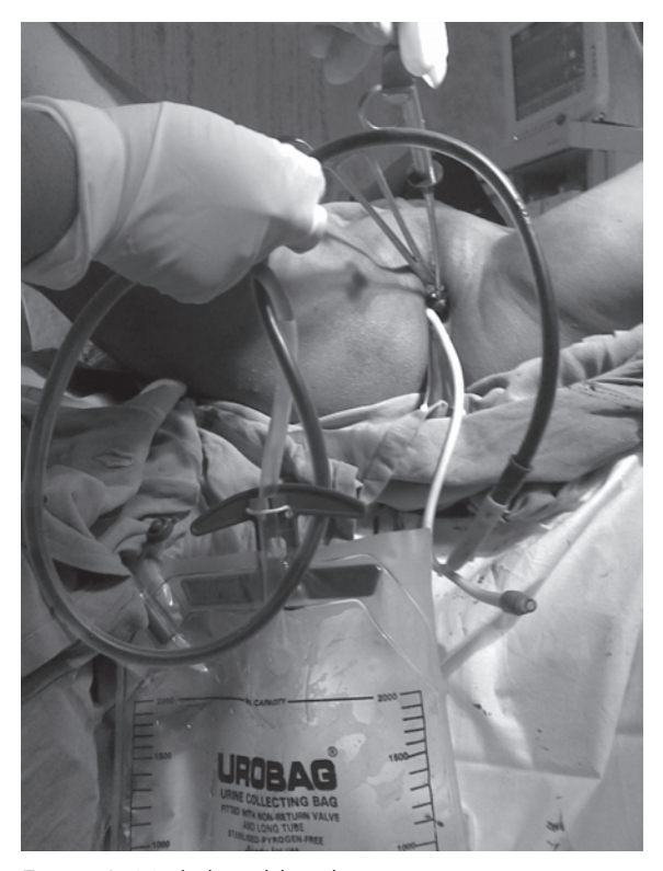
Figure 2. Methylene blue dye test (urine stains blue).

for 4-8 weeks, 5% cases reported to have spontaneous closure, hormonal treatment could be tried in Youssuf syndrome with very small fistula. Reported pregnancy rate after repair is 31.25%, and term delivery rate is 25%, and surgery is the mainstay and transperitoneal route is most effective. After repair hysterectomy is not required for treatment of vesicouterine and fertility can be preserved in selected patients. Very few laparoscopic repairs have also been described. The gynecologist must be aware of the possibility of causing this injury. Even rupture of a full bladder during an extraction of a baby's head in the course of a cesarean section can cause vesicouterine fistula. This instance demonstrates that not only inadequate surgical technique can lead to the lesion's formation but that careful bladder emptying before operation is essential. Meticulous practice of obstetric and surgical principles during obstetrical procedures can prevent the formation of these fistulas.