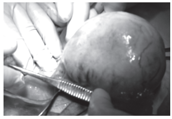
fig 1. ovarian cyst