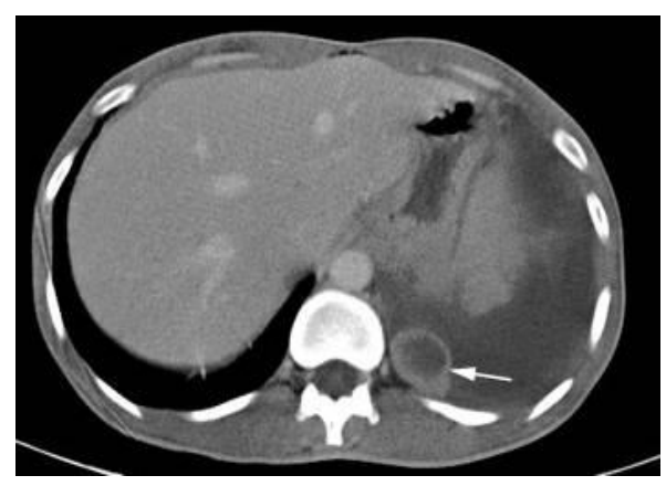
Fig. 1c: Contrast enhanced CT of chest shows well defined rounded peripherally enhancing lesion in the left paravertebral region suggestive of sympathetic chain metastasis (arrow).

together suggested the diagnosis of Askin's tumor (pnet).