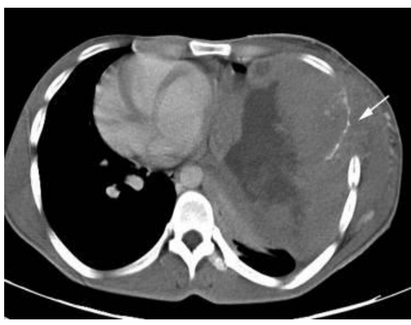
Fig. 1b: Contrast enhanced CT of chest shows large heterogeneously enhancing left chest wall mass involving mediastinal pleura causing collapse consolidation of underlying lung with rib destruction (arrow), and mediastinal shift to right.

Computed Tomography (CT) scan of the chest showed a large heterogeneously enhancing mass in the left chest wall causing collapse and consolidation of the underlying lung. Destruction of the adjacent ribs, involvement of the mediastinal pleura and pericardium of the left atrium was noted (Fig.1b).