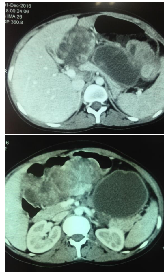
Image 2: Contrast enhanced axial CT images showing heterogeneously enhancing large exo endophytic mass in the region of gastric body and antrum.

GIST is the most common mesenchymal tumor of the gastrointestinal tract which originates from the intestinal interstitial cells of Cajal. Majur and Clark in 1983 gave the term GIST because they lacked immunohistochemical features of Schwann cells and did not have ultrastructural characteristics of smooth muscles.<sup>2</sup> Functional mutations of KIT protooncogene is present in about 95% of GIST. GIST are positive for KIT (CD117) and about 70% express CD34. The intracytoplasmic portion of KIT functions as a tyrosine kinase and hence Imatinib Mesylate which inhibits tyrosine kinase