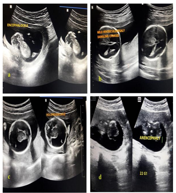
Figure 1: Ultrasound image showing fetal Central Nervous System anomalies 1a .Encephalocele 1b .Ventriculomegaly 1c .Holoprosencephaly 1d . Anencephaly.