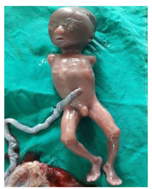
Figure 4: Image of dead fetus with absence of upper bilateral limbs (Amelia).