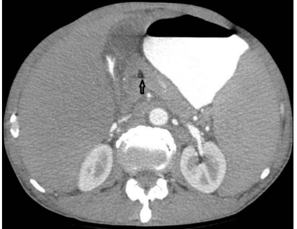
by fatty lesion in the pancreatic neck (arrow), parenchyma. which was interpreted as a lipoma.

Lipomas are benign tumors of homogeneous adipose tissue that is histopathologically identical to subcutaneous fat and entirely circumscribed by a thin (<2 mm) collagen of localized pancreatic fatty masses, such as capsule that may contain fibroreticular septa and scattered vessels<sup>2,4</sup>. The tumor is usually well defined on CT imaging and independent of the surrounding parenchyma, without teratoma infiltration of peripancreatic fat<sup>5</sup>. Lipomas are liposarcoma. typically incidental findings in patients; however, several cases of lipoma have been reported in which the fatty tumor caused obstruction to the biliary or pancreatic duct or compression on the surrounding vessels, thereby requiring total surgical excision<sup>3, 6–9</sup>. It should be noted that all lipomas that required surgical removal were located in the head of the pancreas. The size of a lipoma can vary greatly; the largest one reported by Boglino et al.<sup>7</sup> measured 20 x 30 cm and