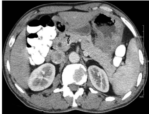
Figure 1: CT image in a patient with carcinoma rectum shows an incidental homogeneous lipoma in the pancreatic neck (arrow), with density matching subcutaneous and retroperitoneal adipose tissue.

lipoma on the basis of CT imaging in a case of carcinoma rectum.