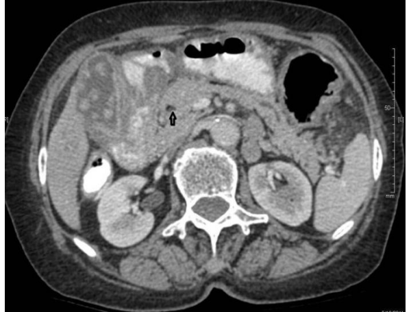
Figure 3: An 85-year old woman with Figure 4: An 80-year old man with typhoid carcinoma gall bladder. A small, oval, fat- fever. Contrast-enhanced abdominal CT density lesion in the pancreatic neck shows an elongated, benign-appearing engulfed (arrow) is completely surrounding

typhoid antibodies. Incidentally identified required surgery, whereas others was an elongated, 1.1 x 1.2x 1.3 cm welldifferentiated, fat-density lesion in the neck of the pancreas (Fig. 4). This pancreatic Diagnostic imaging, in particular CT, can be lesion appeared well encapsulated with an attenuation of -103 HU. This had the appearance of an intrapancreatic lipoma.