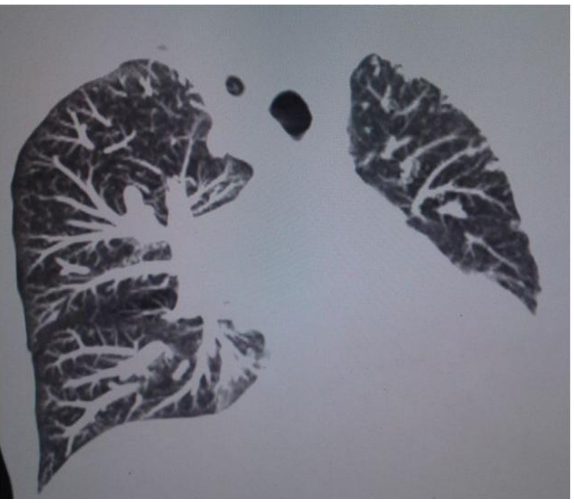
Figure F: coronal CECT of lung with lung window settings showing hyperinflation of the right lung with mildly reduced left lung size and peripheral pleural patchy nodularity. Grossly dilated right lung vasculature and right pulmonary artery noted.

serrated pleural thickening may be identified. The CT scan in the lung window is useful to confirm a normal bronchial branching pattern.