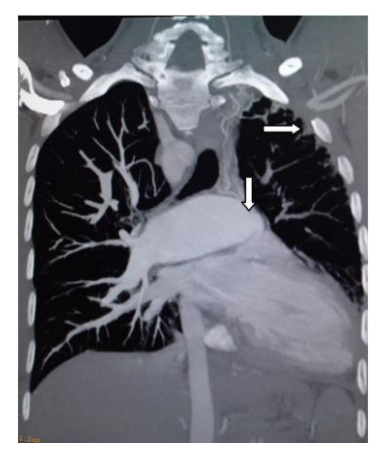
Figure B: Coronal CECT of lung with maximum intensitv projection settings showing complete absence (vertical arrow) of the mediastinal portion of the left main

pulmonary artery with dilated pulmonary trunk and right pulmonary main branch. Prominent mediastinum collateral supplying circulation to the smaller left lung. Left lung was small, the bronchial branching pattern was normal with few patchy foci of pleural thickening (horizontal arrow).