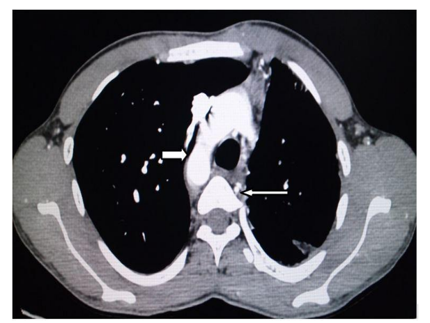
Fig C: axial CECT of lung with mediastinal window settings showing right side aortic arch (left headed horizontal arrow). Dilated pulmonary trunk and right pulmonary main branch. Prominent mediastinum collateral (right headed horizontal arrow) supplying circulation to the smaller left lung.

opposite the aortic arch<sup>2</sup>. Interruption of the left pulmonary artery is usually associated with other cardiovascular congenital anomalies most commonly Tetralogy of Fallot