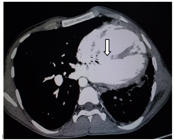
Fig D: axial CECT of lung with mediastinal window settings showing biventricular dilation with large perimembranous VSD suggestive of possible TOF.

group 3, those having an isolated anomaly without pulmonary hypertension <sup>5</sup>. Where as individuals in groups 1 and 2 are unlikely to survive beyond infancy, those in group 3 often present as adults, either with incidental recognition of an abnormal chest radiograph or with hemoptysis.