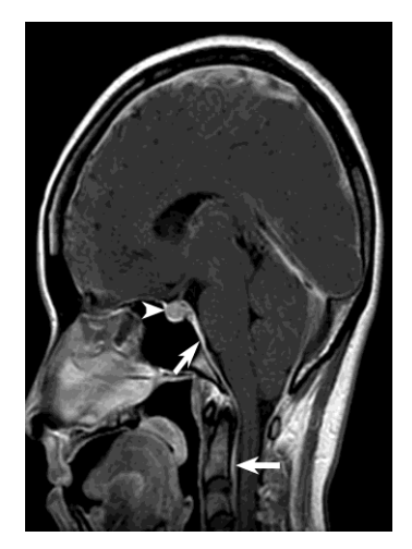
Fig 5: A sagittal contrast - enhanced T1weighted image shows prominent enhancement of the pituitary gland (arrowhead), sagging of the brain with inferiorly

displaced cerebellar tonsils and reduction of the pre-pontine CSF space. The dural enhancement (arrows) extends into the spinal canal.