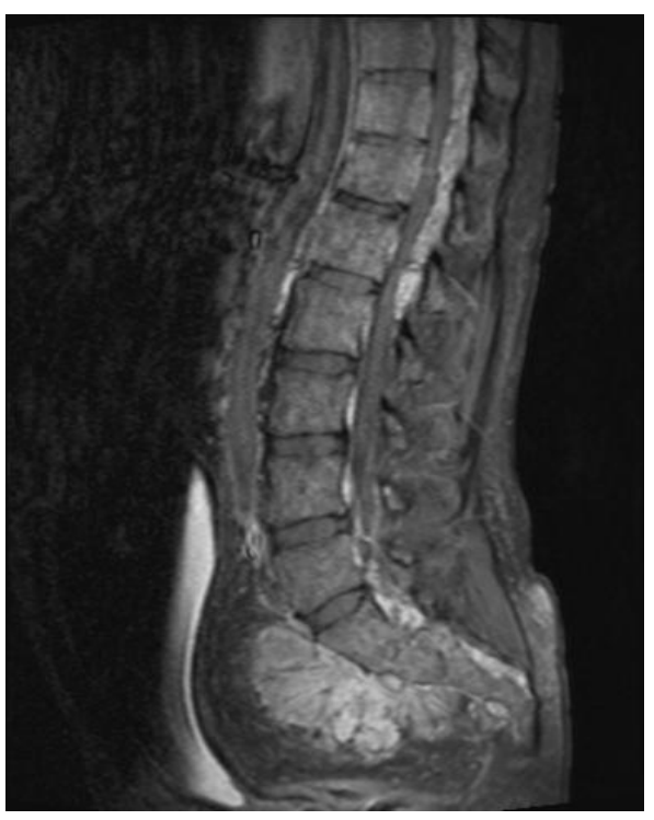
Fig 5: T2 weighted sagittal image showing multiple foci of prevertebral masses.

spleen showed similar signal intensity and enhancement pattern . All the vertebral