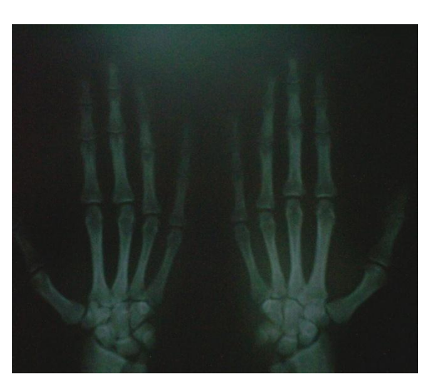
Fig 2: Radiograph of both hands showing coarse trabeculation.

Radiographs of the dorsolumbar spine showed bilateral paravertebral soft-tissue masses with generalized increased density and coarse trabeculae of vertebrae (Fig 1). X -ray skull was almost normal, however that of the hands revealed coarse trabeculation (Fig 2). Ultrasound abdomen revealed hepatomegaly and splenomegaly with large echogenic foci in spleen and a lobulated hypoechoic mass in presacral space which was indenting the urinary bladder in its lower part.