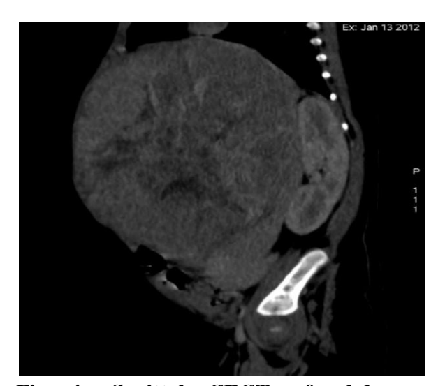
Fig 4: Sagittal CECT of abdomen revealing a large heterogeneous mildly enhancing mass lesion with multiple streaky linear internal enhancing foci and multiple non-enhancing necrotic foci without any evidence of calcifications noted involving right hepatic lobe with peripheral rim of normal hepatic tissue.

Wiedemann <sup>3</sup> noted that approximately 7.5% of patients with BWS develop malignant tumors. The most common is Wilms' tumor, followed by adrenocortical carcinoma, HB, and neuroblastoma. <sup>5</sup> Data reported from the National Cancer Institute's Beckwith-Wiedemann support group indicate a relative risk of hepatoblastoma as 2,280, higher than that for other embryonal tumors, including Wilms' tumor. The relative risk for all cancers in this group was 676. <sup>4</sup>