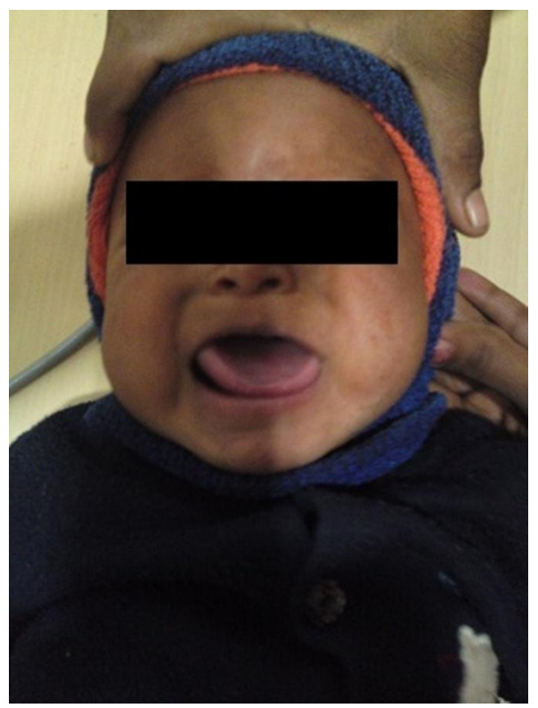
Fig 6: Photograph of the child showing macroglossia and obesity.

weighted pulse sequences and low signal intensity on fat-suppressed images. Calcifications are hypointense on all sequences.<sup>11, 12</sup>