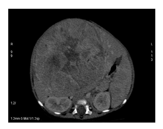
Fig 2: Axial CECT of abdomen revealing a large heterogeneous mildly enhancing mass lesion with multiple streaky linear internal enhancing foci and multiple nonenhancing necrotic foci without any evidence of calcifications noted involving right hepatic lobe with apparent involvement of right portal main branch. Also noted bilateral normal kidneys with mild splenomegaly.

omphalocele, hemihypertrophy, and neonatal hypoglycaemia.<sup>1</sup> The association between embryonal cancer and BWS has been widely reported.<sup>2, 3</sup> A significant relative risk has been reported for Wilms' tumor. neuroblastoma, and hepatoblastoma (HBL).<sup>4</sup> In addition, children with BWS may also exhibit organomegaly, ear pits or creases.<sup>5</sup> Vaughan et al.<sup>6</sup> reported that HH may be an incomplete form of BWS that shares with it a similar increased risk of developing intraabdominal malignancy.BWS occurs due to perturbations of the normal dosage balance of a number of genes clustered at 11p15 (organized in 2 separate domains). Domain 1 contains paternally expressed insulin like growth factor (IGF2) as well as genes and transcripts that control expression of IGF2. Domain 2 contains several imprinted genes including CDKNIC KCNQ10T1 and (L1T1).<sup>1,7</sup>