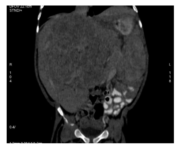
Fig 3: Coronal CECT of abdomen revealing a large heterogeneous mildly enhancing mass lesion with multiple streaky linear internal enhancing foci and multiple non-enhancing necrotic foci without any evidence of calcifications noted involving right hepatic lobe with apparent involvement of right portal main branch. Also noted B/L normal kidneys with mild splenomegaly.