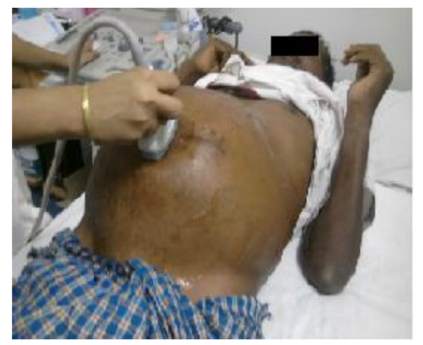
Fig.. 1: Marked distension of abdomen.

manifested by hydrocephalus and raised intracranial pressure. Cases have been reported in paediatric age group and very few cases in adults. Lack of early suspicion with background of alcoholic liver disease in