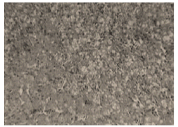
Fig. 6. liver of ducklings in the group5 at 8 th week after withdrawal of aflatoxin showing degenerative changes in the hepatocytes with granular cytoplasm H&E (X 250)