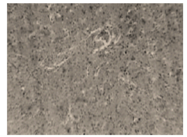
Fig. 8. liver of ducklings in the group6 at 8 th week after withdrawal of aflatoxin showing a complete regeneration of the hepatic parenchyma H&E (X 250)