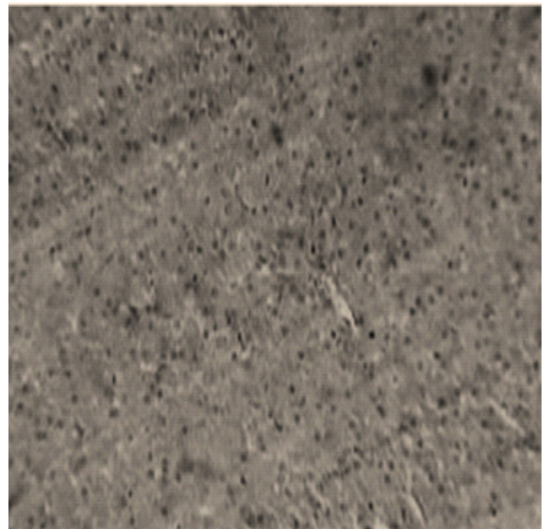
Fig. 1. liver of duck in group1 (control) showing normal and healthy hepatocytes. H&E (X250)

Fig.1 showed normal healthy hepatocytes of control (group1). While, Fig. 2 showed diffuse hydropic degeneration due to oral administration of aflatoxin for two weeks. Histopathologically, in group4 at 6th week Fig.3 showed normal healthy hepatocytes. While at 8<sup>th</sup> week after aflatoxin withdrawal, N. sativa succeeded to induce an activation of lymphoid aggregation in liver (Fig.4). Fig.5 showed the liver of ducklings in the group5 at 6<sup>th</sup> week after withdrawal of aflatoxin showing diffuse hydropic degeneration. While a degenerative changes in the hepatocytes with granular cytoplasm were noticed at 8th week (Fig. 6) .Fig. 7 cleared that; addition of N. sativa in group6 at 6<sup>th</sup> week induced a focal infiltration of inflammatory cells besides mild hydropic degeneration. While addition of N.sativa (8<sup>th</sup> week) induced a complete regeneration of the hepatic parenchyma (Fig. 8). Oral administration of