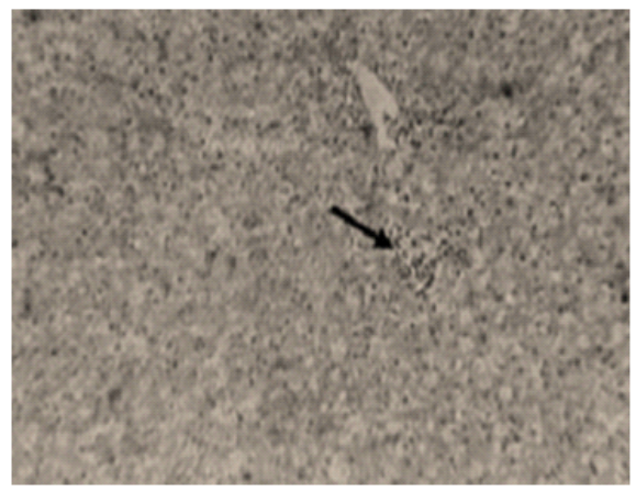
Fig. 7. liver of ducklings in the group6 at 6 Th week after withdrawal of aflatoxin showing focal infiltration of inflammatory cells (arrow) beside mild hydropic degeneration H&E (X 250)