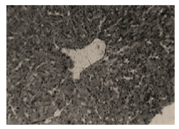
Fig. 3. liver of ducklings in N. sativa at 6 th week after withdrawal of aflatoxin showing normal hepatocytes. (H&E (X 250)