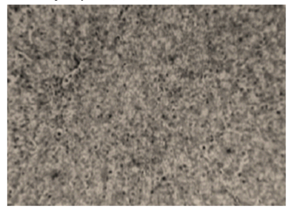
Fig. 5. liver of ducklings in the group5 at 6 th week after withdrawal of aflatoxin showing diffuse hydropic degeneration H&E (X 250)