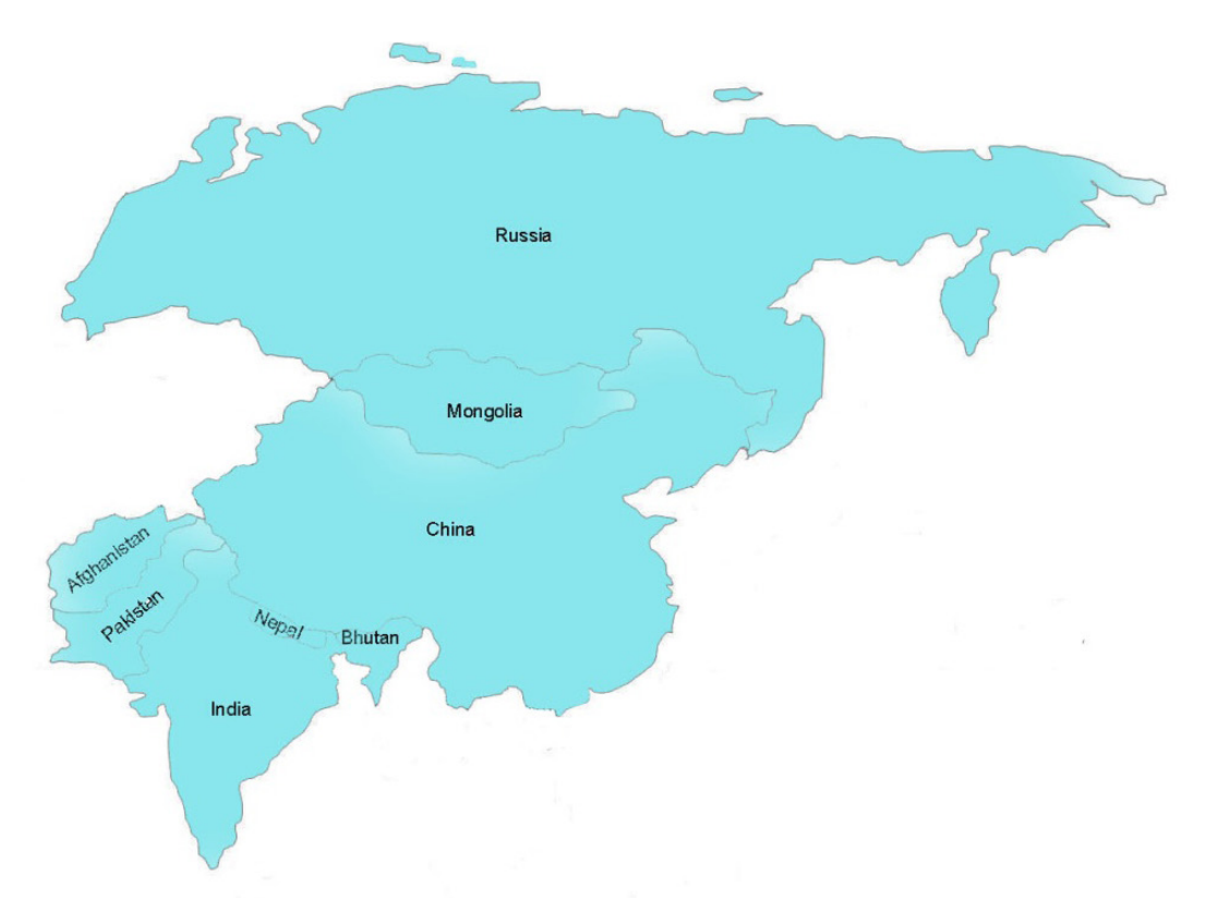
Fig. 2. Distribution of Dactylorhizahatagirea Ref.: Raskoti and Ale (2009) and Flora of China Editorial Committee(2009)

(Watanabe et al. , 2005; Baral and Kurmi 2006; Pant and Raskoti, 2013; Boladi et al. , 2018 and Nand et al. , 2018, Chamoli and Sharan, 2019, Magar et al. , 2020). It is also considered an alternative source of salep used very commonly in Europe and is considered an essential aphrodisiac plant in Ayurveda, Siddha, Unani literature. Therefore, it is employed to enhance performance and to increase vigour and vitality (Pant and Rinchen, 2012).