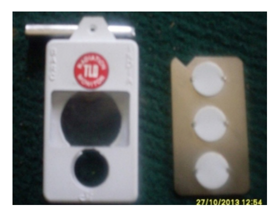
Fig.1. TLD badge

are read (Nucleonix 2013) as shown in Fig.2.