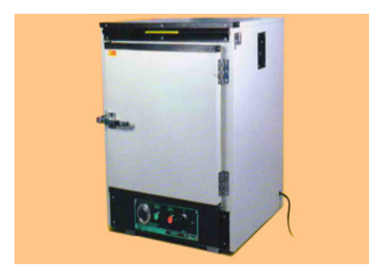
Fig.3. Annealing Oven Also, calibration of the badge reader and quality

In order to recover original TLD sensitivity of the irradiation and readout, all cards were subjected to an annealing treatment at an elevated temperature of about 300 degree Celsius for 3 hours before their us in an annealing oven (Furetta 2003; Shrivastava et al. , 2011, Lakshmanan 2008) as given in Fig.3.