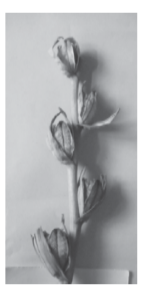
Plate III- Intrepid × Psittacinus hybrid