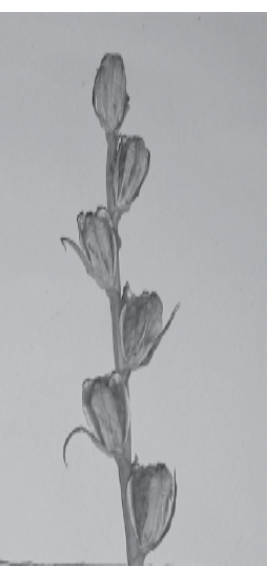
Plate IV- G-4 × Psittacinus hybrid