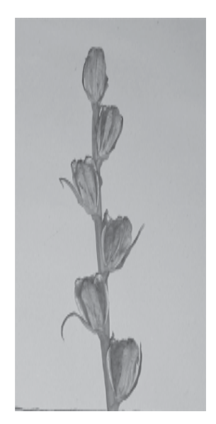
Plate V- Psittacinus hybrid × G-4