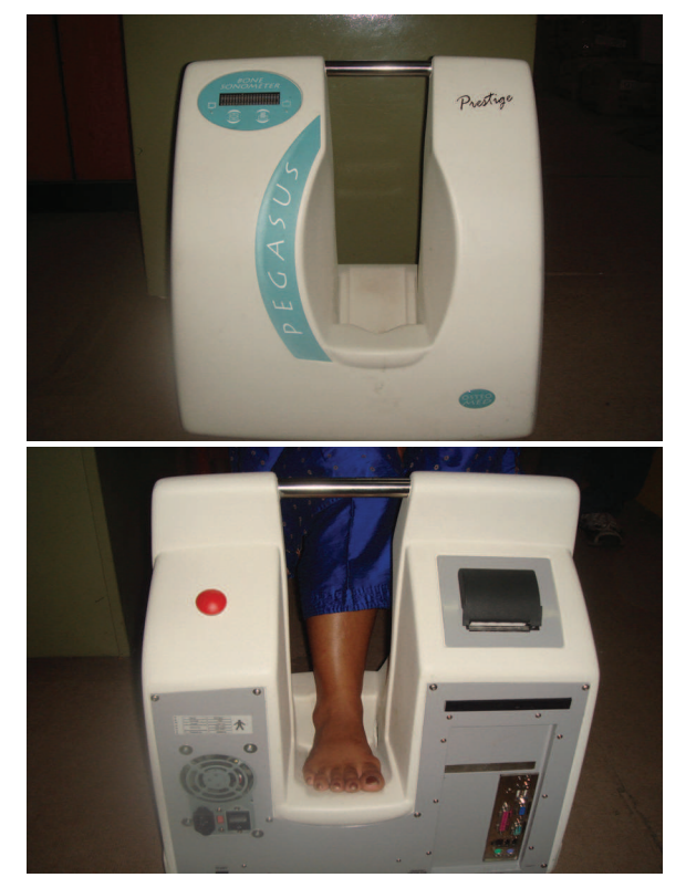
Figure 1. QUS device and Measurement of bone density

Bone mass was assessed by broad band ultrasound attenuation using a QUS device. This device is small and portable, with a gel-coupled (dry) system that can measure BUA and speed of sound at the calcaneus. For all subjects, QUS was performed at the right calcaneus. The T -score for each subject was calculated by using the peak BUA value for a defined population of young adults (ASIAN)