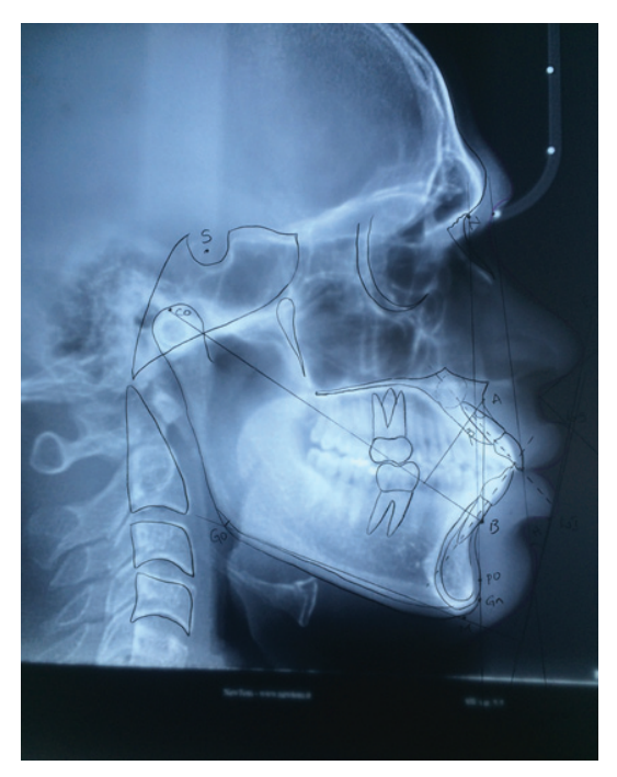
Figure 1: Patient cephalogram