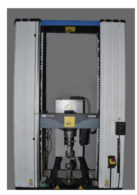
Figure 1: Universal Testing Machine (Instron)