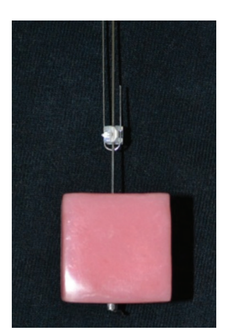
Figure 2: Custom made apparatus with test sample