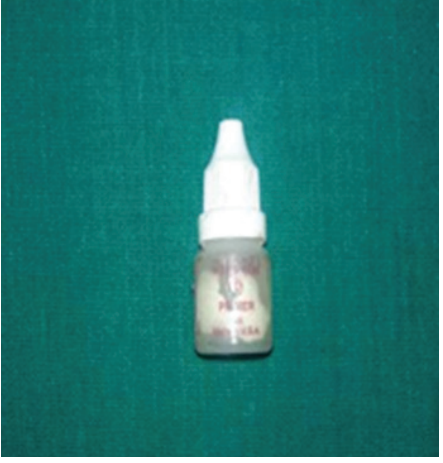
Figure 3: Conventional primer