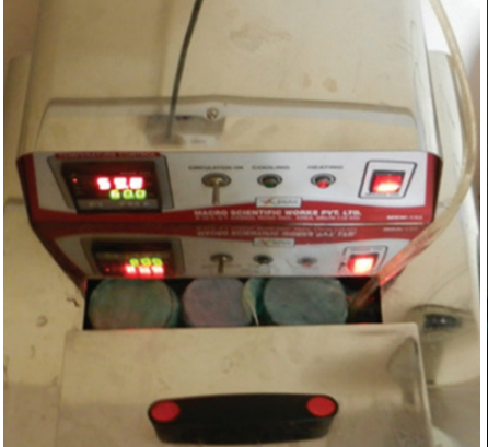
Figure 5: Thermocycling unit