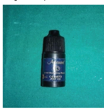
Figure 4: Adhesion booster