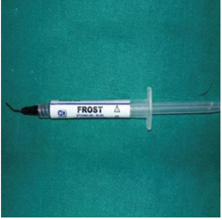
Figure 2: 37% Orthophosphoric acid