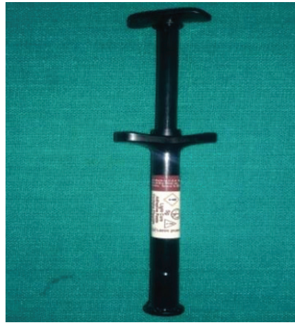
Figure 1: Composit resin with fluoride

The data were subjected to statistical analysis to determine the most effective material on shear bond strength. Descriptive statistics with mean and standard deviation were calculated and Student's t-test were performed to find the statistical difference between the groups.