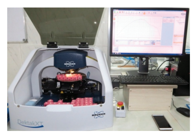
Figure 1: Profilometer