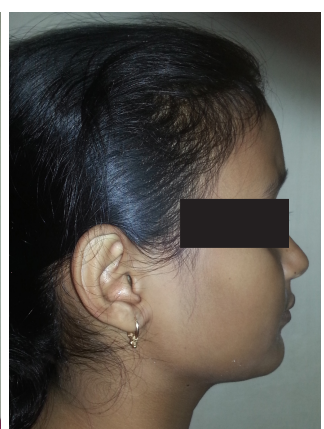
Figure 2B: Pre-Treatment Extraroral View: Profile