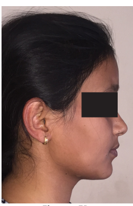
Figure 5B: View: Profile