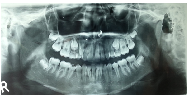
Figure 3D: Pre-Treatment Orthopantomogram