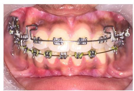
Figure 4A: MKLMD Archwire Placement: Frontal