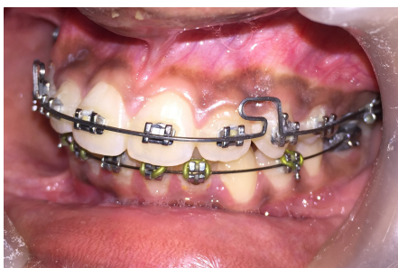
Figure 4B: MKLMD Archwire Placement: Left Buccal View