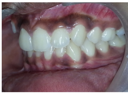
Figure 3B: Pre-Treatment Intraoral View: Left Buccal View