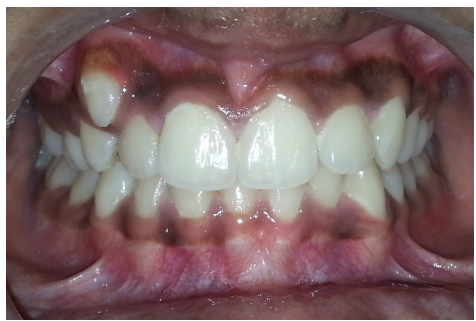
Figure 3A: Pre-Treatment Intraoral View: Frontal