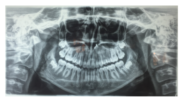
Figure 6D: Post-Treatment Orthopantomogram