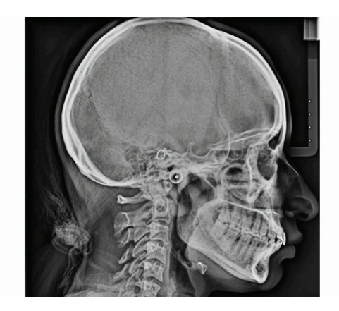
Fig 2: Pre Treatment Radiographs