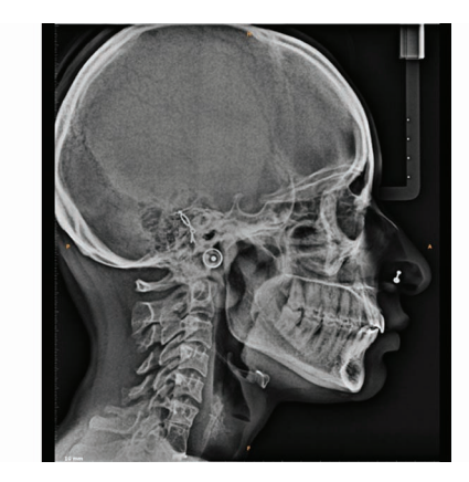
Fig 5: Post Treatment radiographs