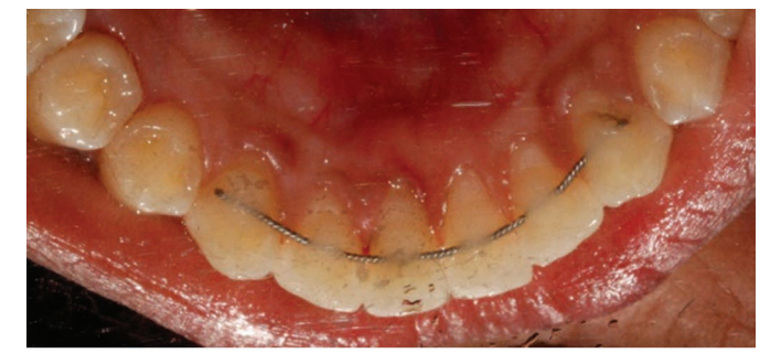
Fig 7: Retention Photograph