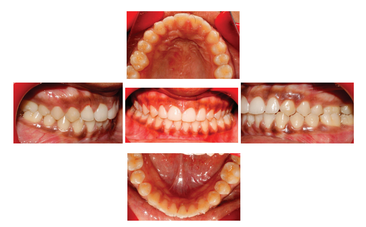
Fig: 4: Post Treatment Intraoral Photograph