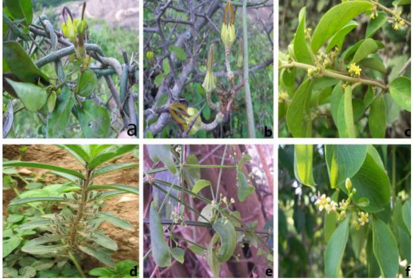
Figure 2. Invention of rare, endanger and threatened (RET) plant species in Maruthamalai Hills, Coimbatore district, Western Ghats of Tamilnadu, South India. a- Ceropegia candelabrum var biflora, b- Ceropegia juncea, c-Gymnema sylvestre, d- Andrographis echinoids, e-Rubia cardifolia, f-Decalepis hamiltonii.