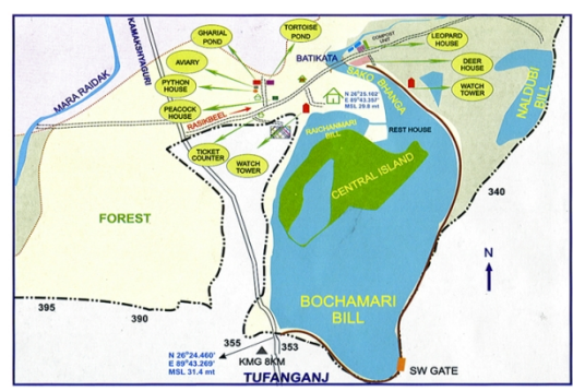
Figure 2. Map (without scale) of Rasikbeel Wetland Complex.

Buxa Tiger Reserve (BTR), in the Alipurduar Sub-Division of Jalpaiguri District was setup as the 15th Tiger Reserve in the country in 1983 at the northeastern corner of West Bengal bordering Bhutan and Assam. The present studies were conducted at or near Raja Bhat Khawa, Buxa Fort, Raimatang and Javanti of BTR. The area of the BTR encompasses 760.87 Km<sup>2</sup> having a sanctuary of 269 km<sup>2</sup> and a National Park of 117.01 km<sup>2</sup> of pristine forests and is situated in the transition zone between Biome-8 (Sino-Himalayan Subtropical Forest) and Biome-12 (Indo-Gangetic Plain) (Islam and Rahmani, 2004). This reserve has distinct habitat division into zones like Tarai (transitional zone between forest belt and cultivated plains characterized by the presence of reeds and grasses), Bhabar (narrow forest belt characterized with complete absence of water sources) and hilly landscape mounts with an altitude of 1800 m and is crisscrossed by numerous rivers and rivulets. IBA site code of this region is IN-WB-01 with A1 and A2 criteria. Fraction of this IBA also falls within the Eastern Himalayas Endemic Bird Area (EBA 130) which consists of 21 restricted range species (Stattersfield et al., 1998). According to Champion and Seth (1968) BTR has eight Sub-types.