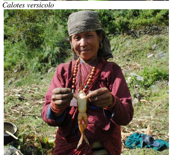
A local women with O. sikimensis: Species of herpetofauna, particularly O. sikimensis are used as suppliment food by some local communities

Plate 2. Herpetofauna recorded from Manaslu Conservation Area.