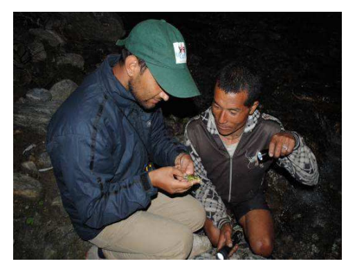
Figure 2. Identification of species at the site.

This study was mainly based on the field survey of the Manaslu CA. Stream survey and trail survey was conducted. Random transect method has been applied in order to sampling in the area for intensive study. In each transect along the forest trail and streams two persons walked covering a distance of 5 m on both sides from the south to Northeast of the CA (Fig. 1) Opportunistic survey has also be conducted in other parts from transect lines based on (Gardner and Fitzherbert, 2007). Amphibians and reptiles were surveyed by using hand picking (using equipment for handling the reptiles and amphibians) in the sites (Fig. 2). For noc turnal survey a torch beam was used to locate the animal (Behangana and Arusi, 2004). Species caught during survey were