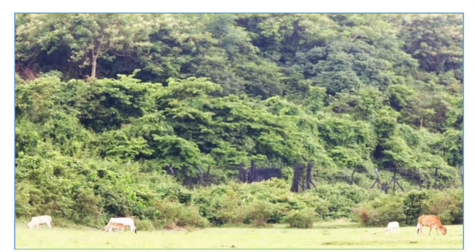
Figure 2. Metal gate on fence, which used as entrance for elephant to the study area.