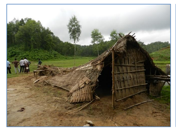
Figure 4. House destroyed by elephants in Nalitabari.

Banana, and the total loss was USD 115 (BDT 9,000) (Fig. 5).