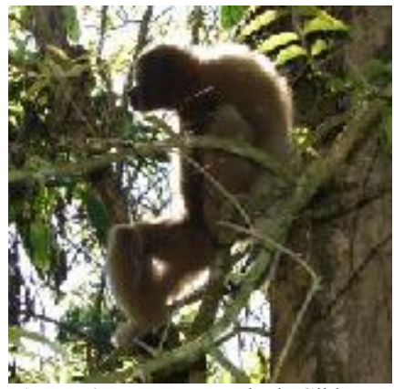
Figure 4. Western Hoolock Gibbon Hoolock hoolock