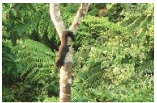
Figure 7. Orange Bellied Himalayan Squirrel Dremomy lokriah