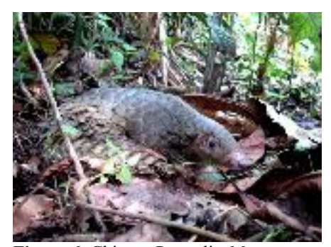
Figure 6. Chinese Pangolin Manis pentadactyla