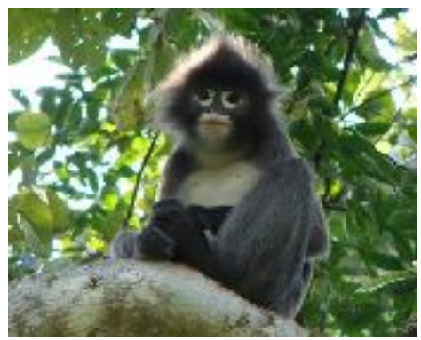
Figure 3. Phayre's Leaf Langur Trachypithecus phayrei