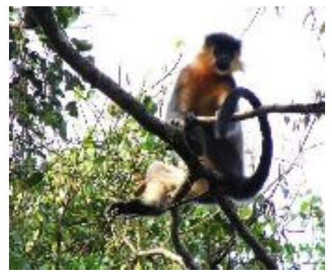
Figure 2 . Capped Langur Trachypithecus pileatus

K. Mazumdar, R. Soud and A. Gupta /Our Nature (2011) 9:119-127