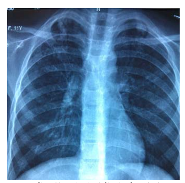
Figure 2. Chest X-ray showing Infiltrative Opacities in upper zone

There was no significant cervical lymphadenopathy. In view of clinical presentation, a provisional diagnosis of granulomatous disease of soft palate with strong suspicion of tuberculosis was made. Complete blood count with ESR, montoux test, and chest x-ray were ordered. The results of investigations were: ESR was 77mm/hr, montoux test was positive (14mm), and chest x ray showed bilateral nodular and infiltrative opacities in upper zone (figure 2), suggestive of tuberculosis. Child was advised for sputum examination for acid fast bacilli but she did not cooperate for sample collection, hence sputum examination was not done. Serology for human immunodeficiency virus was negative. Her blood and urine culture were negative. Punch Biopsy of the lesion was done under local anesthesia and sent for histopathological examination The biopsy showed multiple tubercular granulomas with areas of caseation (figure 3). Thus, a diagnosis of tuberculosis of soft palate secondary to pulmonary TB was made and child was started on ATT and has been on regular follow up.