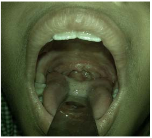
Figure 1. Clinical Photograph of Patients

An 8 year old female child presented to Otolaryngology department of our hospital with complaints of difficulty in swallowing and fever for past 3 months. Child also gave history of productive, mucopurulent cough for past 3 months. She had decreased appetite and weight loss for past 2 months. There was no past or family history of tuberculosis. Child was immunised for age. On examination, child appeared pale and weighed only