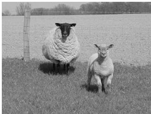
Fig-5: Perspective of sheep farming in Karnali Region

ungrazed areas on ridges, sloppy area where livestock normally avoid to graze. Sustainable grassland management community initiations and policy efforts would enhance the productivity of bio resources in the region. It would help to improve the commercial livestock farming and production of medicinal species. There is high potentiality to promote the commercial livestock farming for the sustainable livelihood improvement of the inhabitant of the Karnali region. The perspective of the scientific grassland management in the region is too high as given in fig-5.