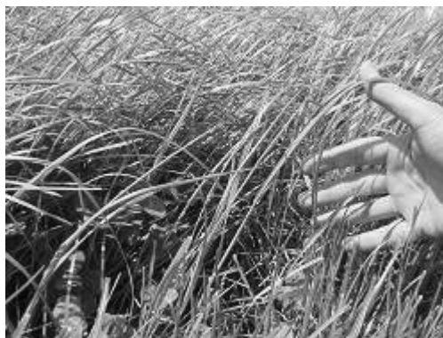
Fig-2: Summer Grassland Scene

watershed are severely abused, misused and overused due to improper grazing system, weak government policy and low level of public awareness on common resource like grassland management sustainably. Similarly, limited data from partial survey on grassland management and utilization show the grasslands have been rapidly degraded in the area. Very few technical assessment made in past by governmental and non-governmental organizations show that the regions' overgrazing trends had led large amount of soil erosion and more than 60 percent grasslands have been losing productivity. An example of summer grass seen has been given in fig-2