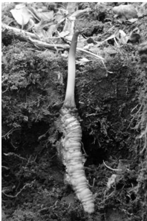
Fig-3: Sample of Yarsagumba found in Pasture/grassland in Karnali Watershed Area