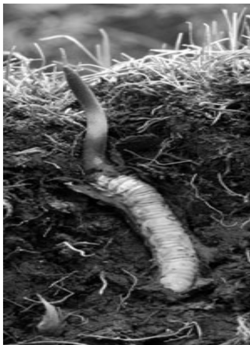
Fig-4: Usable Upper part of Yarsagumba

Yarasagumba has been a part of traditional Chinese medicine since ancient times. Its many attributes have been studied at some length by some scholars, particularly Chinese scholars who recommend Yarasagumba for the treatment of stress and fatigue, for respiratory diseases like tuberculosis and asthma, for disease related to the kidneys and the liver, as well as for cardiovascular distresses, and so on. However, the one use of Yarasagumba that has caught most of the world's attention is its use as an aphrodisiac. Tibetan medicine lists Yarasagumba as a tonic for boosting immunity and for enhancing virility aside from its supplementary role along with other medicines in kidney, lungs and heart problems. Yarasagumba is also recommended by Tibetan traditional practitioners for improving eyesight and for treating Hepatitis B.