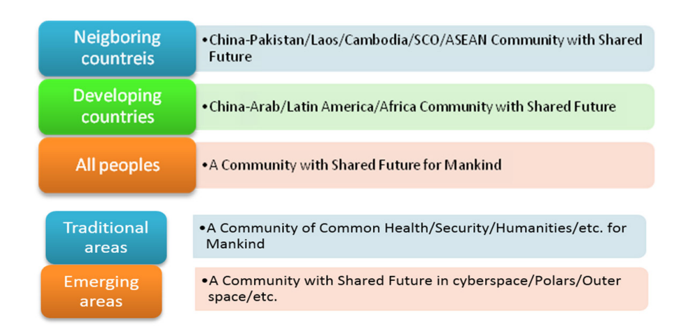
Figure 2: The spatial dimension of GCSF

Block-chain leads to a decentralised system but the global governance heavily relied on hegemony in the experience. Thus, the international community has to revise its action of code and seek a new way of cooperation, and GCSF, as China says, can be the solution. That is why more abstract areas such as technology and humanities are also covered by GCSF. For these areas, China advocates that the principles guiding the new fields are peace, sovereignty, mutual benefit, and common governance, rather than zero-sum games.<sup>65</sup>