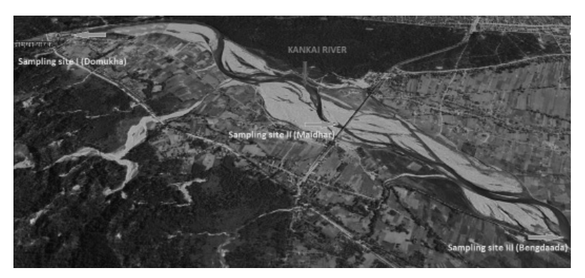
Fig1. Map showing Kankai River with sampling sites

daytime between 10 a.m. to 1 p.m. at each sampling site; uniformity in selection was maintained. We sampled for about 100-150 m river stretch from downstream to upstream with different fish habitats such as riffles, runs and pools. The collected fishes were enumerated, and some were preserved in 10% formalin for voucher specimens. Further lab analysis was carried out at Tri-Chandra Multiple Campus, Ghantaghar, Kathmandu. Fishes were identified to species level after [10, 13, 6]. The FishBase [14] was used for species authority and English common names used in this article.