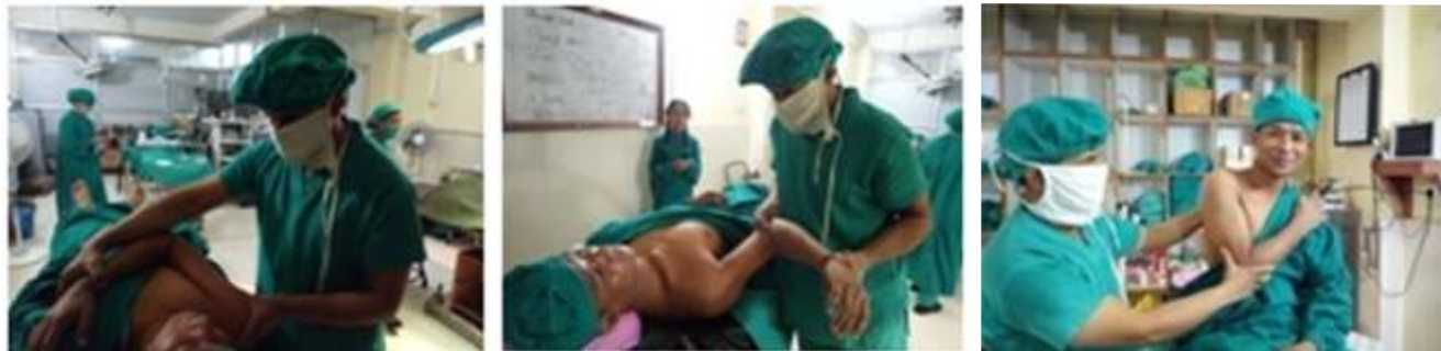
Figure 2: Reduction maneuver.