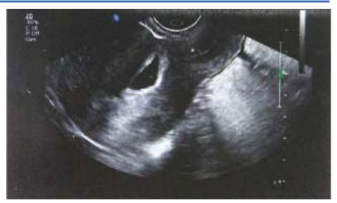
Figure 1. Transvaginalultrasonogram showing 2.1 × 1.1 cm gestational sac implanted in the anterior lower segment of the uterus.

A 37 year old G6P2A3 presented with vaginal bleeding and six weeks of amenorrhea. She had two cesarean deliveries and three induced abortions in between the deliveries. There was lower abdominal tenderness on deep palpation and the ultrasonography showed a gestational sac containing yolk sac of 2.1 × 1.1 cm located in the anterior lower uterine wall in the area adjacent to her prior cesarean scar (Figure 1). Serum ß-hCG at the presentation was 28501mIU/mL. So with the diagnosis of CSP, the patient was planned for local methotrexate injection into the chorionic sac under transabdominal ultrasound guidance using a 22gauge needle, the amount of MTX being 50mg/m<sup>2</sup>, without anesthesia. Following the procedure, the level of ß-hCG showed an initial increment to 29885 mIU/mL followed by gradual decreasing pattern. However even after a week there was persistent mild vaginal bleeding with residual mass evident in USG; although there was a drop in ß-hCG to 4533mIU/mL. Hence, ultrasound guided suction and evacuation of sac was done under IV anesthesia (Figure 2). There was no complication and the symptoms along with the ß-hCG level subsided gradually. She was discharged and followed up after three weeks with pelvic sonogram showing complete resolution of mass and ß-hCG level being declined to negligible level.