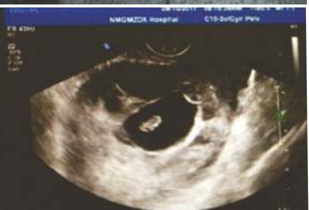
Figure 3. Color Doppler transvaginal USG showing a gestation sac 4.9 \times 3.0 cm with a mixed echoic mass of diameter 3.7 \times 2.9 cm in the lower segment cesarean scar