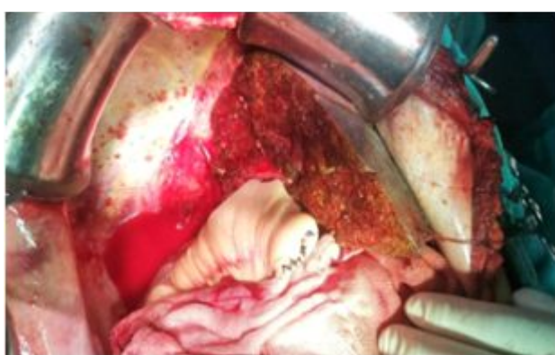
Figure 2: Completed left hepaticojejunostomy