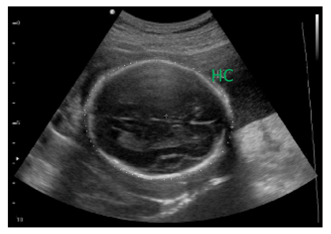
Figure 2: Measurement of Head circumference (HC)

Head circumference (HC) was measured on a real time ultrasound machine at the same section as above using ellipse method by tracing the head circumference along the outer skull table.