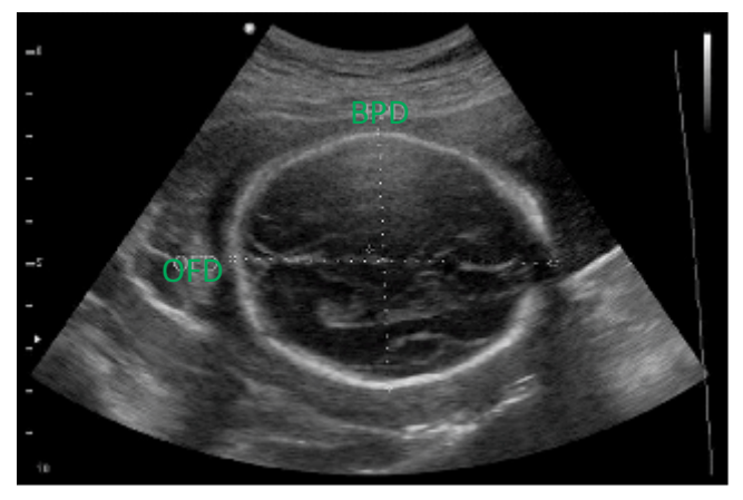
Figure 1: Measurement of biparietal diameter (BPD)

Biparietal diameter (BPD) was measured on a real time ultrasound machine in a transverse plane over the frozen image from the outer edge of the proximal skull to the inner edge of the distal skull table, with electronic calipers placed on a line perpendicular to the mid line echo.