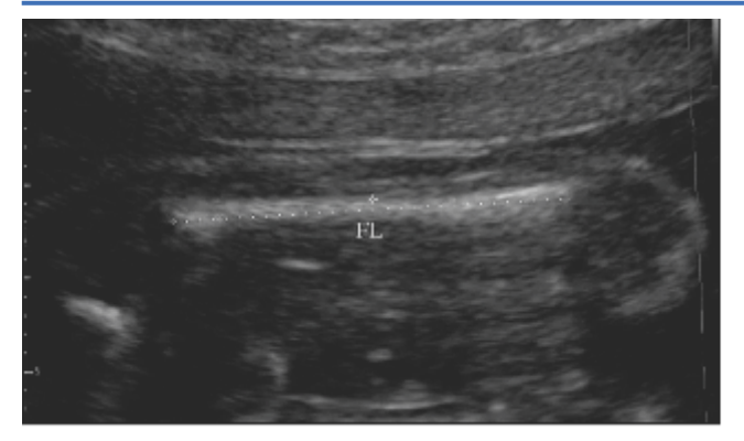
Figure 4: Measurement of femur length (FL)

The estimated fetal weight was obtained using the following parameters vizBPD, HC, AC, FL, which were applied to the under mentioned formulae, and entered in Microsoft excel.