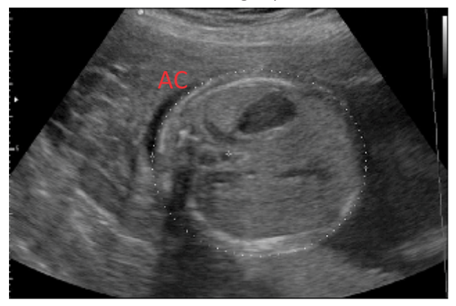
Figure 3: Measurement of abdominal circumference (AC)

Abdominal circumference (AC) was measured on a real time ultrasound machine at the level of umbilical vein as it enters the left portal vein. Stomach bubble was also taken as landmark. It was measured using ellipse method.