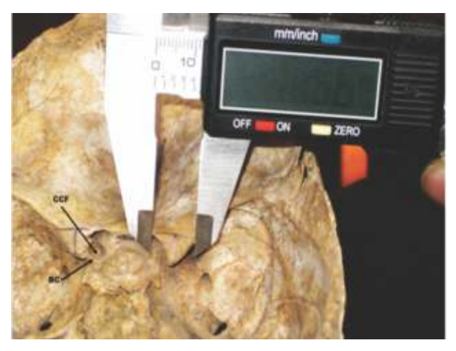
Figure 2: Photograph depicts the measurement of base of the right ACP. Arrow shows left CCF and BC (Bony connection between the tip of left ACP and MCP)

Figure 1: Photograph shows how the measurements were taken. (A) Height of ACP, (B) Base of ACP, (C) Distance between the posterior edge of the crista galli (CG) and the apex of the ACP, (D) Distance between the apex of ACP and tip of the lateral-most projection of the PCP, (E) Distance between the apexes of the ACP, (F) Distance between the tips of the lateral-most extension of the PCPs