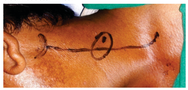
Figure 3: Marking for SCPB

The patient was placed in a supine position with a small towel under his head, with his head turned to the side contrary to the one to be blocked. 10 Against gentle resistance from the anesthetist's hand, the patient was instructed to lift his or her head. A simultaneous slight Valsalva's maneuver was encouraged to help outline the sternocleidomastoid muscle and locate the external jugular vein. 10 The midpoint of the posterior border of the sternocleidomastoid muscle was located and marked. This usually corresponds with the external jugular vein as it crosses the border of the muscle(Fig 3).10 After skin cleansing with an antiseptic solution, a skin wheal was raised at the site of the needle insertion using a 22-gauge, 4-cm needle injecting 5 mL of solution along the posterior border of the sternocleidomastoid muscle (Fig 4). The needle was inserted in multiple direction using a "fan" technique as shown in figure 2. It is possible to block the accessory nerve with this injection, resulting in temporary ipsilateral trapezius muscle paralysis.9 An Inferior Alveolar nerve block and Long Buccal nerve block (Trigeminal V3) was obtained using a closed mouth technique (Vazirani-Akinosi). After ten to 15 minutes of injection of the local anesthetic the adequacy of the block was determined.2