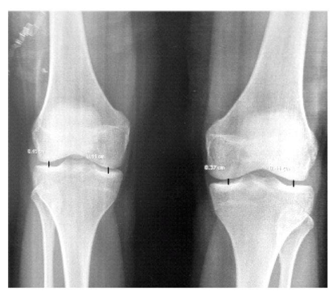
Figure 1: Radiograph of right and left knee joints showing joint space (Black marks).

The data was analyzed by using Statistical Package for Social Sciences (SPSS) version 23.0 software. The measured data was summarized as mean, standard deviation and range. The correlation between the measured joint space width and sex was determined with analysis of student's t-test and between the measured joint space width and age group was determined by using one way ANOVA.