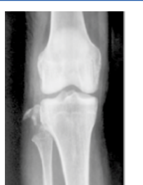
Figure 2e: Fibula head fracture

Since the sample size was relatively smaller, so we used the Fisher exact test with a 2 x 2 contingency table (table 3). The Fisher exact test result was significant at p<0.05.