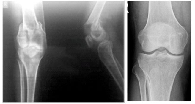
Figure 2c: Distal femur fracture Figure 2d: Tibial spine fracture