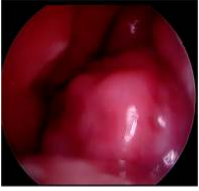
Figure 2: Showing elevation of left nasal cavity floor on endoscopic examination.