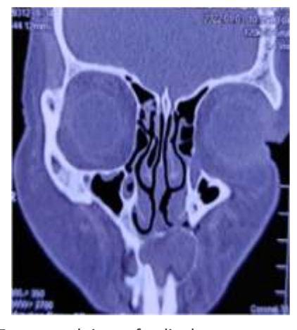
Figure 3: CT paranasal sinus of radicular cyst