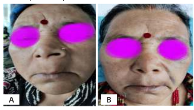
Figure 1: A. upper labial region swelling preoperatively B. postoperative removal of swelling

maxilla. After a cystic rupture, a brownish viscous fluid came out. The endoscope was used to visualize the entire dissection and separation of the cyst from the bony wall(Figure. 4B).It was completely removed and cyst was found 4*4.5 cm dimension (Figure. 5A&B). As there was also deviated nasal septum of the patient, endoscopic septoplasty was performed. The nose was packed with a merocel. The dead space made after cyst removal was packed with antibiotics impregnated ribbon gauze and removed at 5<sup>th</sup> POD.The patient was discharged at the 7th POD without any complaint(Figure. 1B). The postoperative healing phase remained uneventful. Histopathology revealed cystic structure lined by stratified squamous epithelium with granulation tissue and stroma containing dense acute and chronic inflammatory cells (Figure.6&7). On one month follow-up, the patient was quite pleased and satisfied, and the cyst had not recurred.